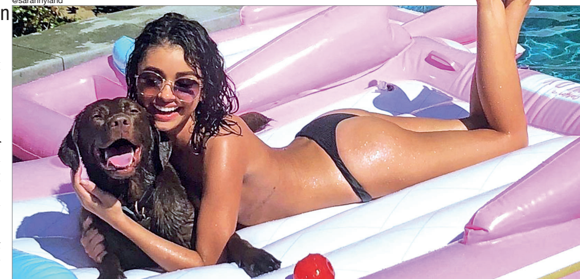
#VACAYGOALS: Sarah Hyland's float is inspired by a pink convertible with a built-in cooler

Pool parties and mass gatherings like Coachella are the floatie's natural habitat. In New Jersey, Floats & Boats is a popular festival at Tices Shoal that, as the name implies, celebrates both floats and boats. In a Facebook post, the or-