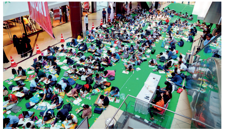
WORK IN PROGRESS: At Hyderabad Next Galleria Mall @Punjabgutta