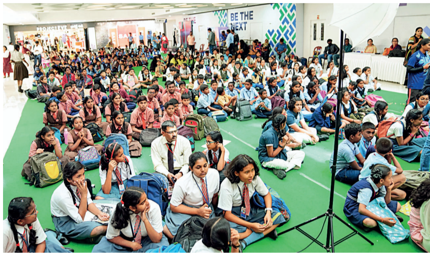
ALL SET: Participants at Hyderabad Next Galleria Mall