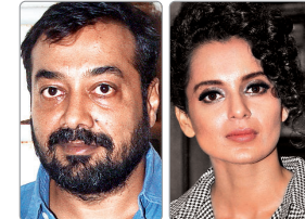
AFTER LETTER TO PM OVER LYNCHINGS, COUNTER LETTER CALLS IT 'SELECTIVE OUTRAGE' P12

Follow us on: twitter.com/HydTimes facebook.com/HyderabadTimesTOI instagram.com/hyderabad_times